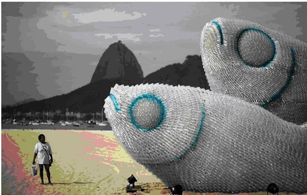
Fish installations from plastic bottles,

Andre Brossil [Ecofuturist Artist] creating a unique piece of art, the spherical Sun power generator , is not just an artistic interpretation of renewable energy but it is also a renewable energy invention. The sculpture is a structure that generates twice the Normal amount of solar energy possible with the Solar Panel this also works using significantly less surface area we can use this invention to charge an electric car or serve as a high power lamp at night. 10 [image -7]