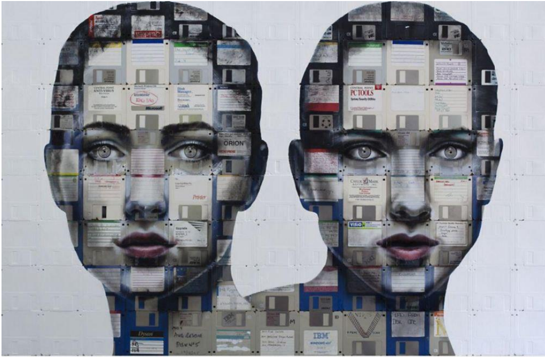
Image -8, Artist - Nick Gentry, [source of image - arte8lusso.net ]