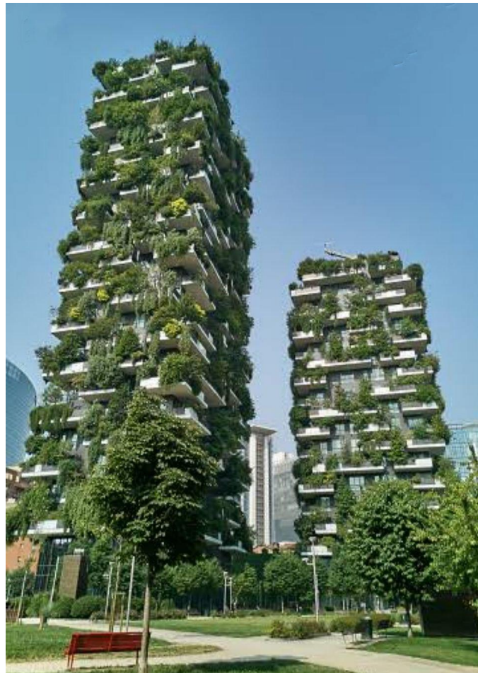
Image -2 , Bosco -Verticale -Milan [Italy], [image source - wikipedia -e net ] Copyright © 2022, Scholarly Research Journal for Interdisciplinary Studies

The buildings biodiversity is expected to attract New birds and insect species to the city . It is also used to moderate temperatures in the buildings in the winter and summer by shading the interiors from the sun and blocking Harsh winds . The vegetation also protects the interior spaces from noise pollution and dust from street level traffic. The building itself is self-sufficient by using renewable energy from solar panels and filtered Waste water to sustain the building's plant life; these green technology systems reduce the overall waste and carbon footprint of the towers . [image -2 ]