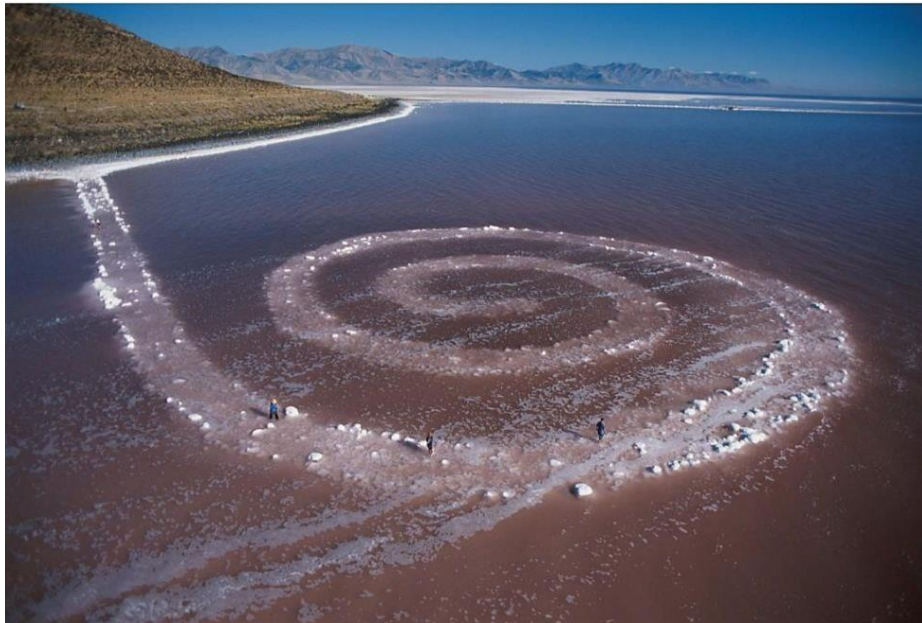
Image -5 , Land Art ,Spiral Jetty by Robert Smithson

The most prominent example of land art is Spiral Jetty. 8 Spiral jetty is an earthwork sculpture constructed in april 1970 that is considered to be the Robert smithson built on the North Eastern shore of the great salt lake near rosal point in Utah Entirely of mud salt , crystals, basalt rocks and water. Spiral Jetty forms a 460 meters wide counterclockwise coil jutting from the Shore of the lake . [image -5 ]