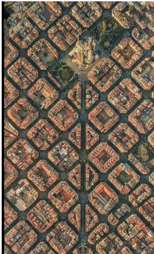
Image - 4 , Barcelona City - Spain

And second, his plan embodied what is - then and today- a striking egalitarianism . Each block [manzana] was to be of almost identical proportions, with buildings of regular height and spacing and preponderance of green space. Commerce was to take place on the ground floor , the bourgeoisie were to live on the floor above[ rather than mansions at the edge of town and the workers were slated for the upper floors . In this way they would all share the same streets and public spaces, exposed to the same hygienic conditions , reducing social distance and inequality . [ image - 4]