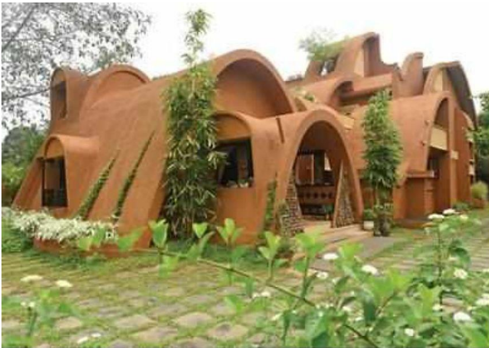
Image -3 , Mud House , Kerala

Another beautiful example of art and sustainable architecture is Mud Houses . Mud construction system is less energy intensive and very effective in different climate conditions . Earth Is one of man's oldest building materials and most and share civilizations used in some form. It was easily available cheap and strong and required only simple Technology . In Egypt The Grain stores of Ramassume building built in Adobe in 1300 BC still exist ,the Great Wall of China has sections built in rammed earth over 2000 years ago . Iran ,India ,Nepal, Yemen all have examples of ancient cities and large buildings built in various forms of earthen Constructions. 5 History repeats itself nowadays. There is a craze for mud houses in hotels, restaurants , guesthouses , and for personal homes also . Kerala based Architect G Shankar mud house at Mudavanmugal in Thiruvananthapuram, is the eye catching 3000 square feet mud house near banks of Vellayani lake. 6 [image - 3 ]